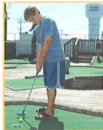
PA line-up shots at Club 18

Both courses are highly recommended due to the ease of play, great atmosphere, hole design, free parking and proximity to other local attractions.